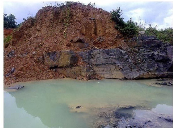
Figure 4. Degradation of land, vegetation and breeding of disease vectors from mining at Ameka, Nigeria [10]

Figure 5 represents an excavator clearing farmlands in the Djado District and plateau in the Agadez Region of Niger. Mining has destroyed farmlands and endangered animal species.