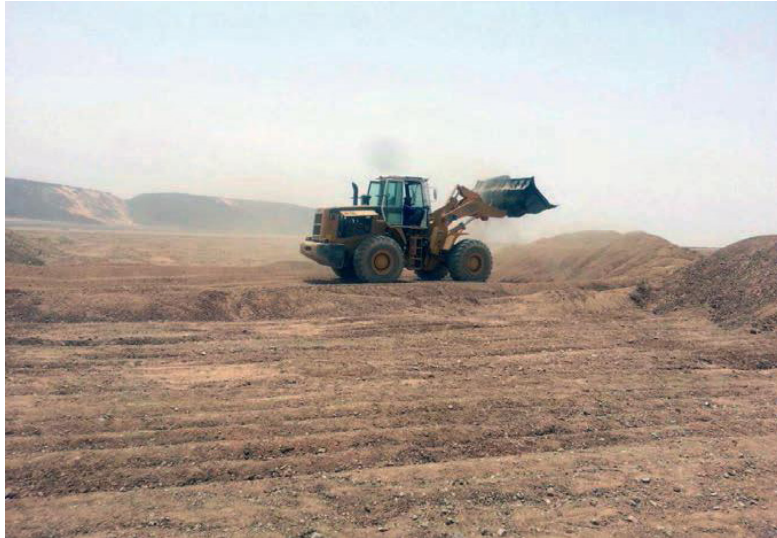
Figure 5. An excavator clearing farmlands for mining in the Djado District of Northern Niger [34]

Figure 6 indicates degrading mining land in the Djado District in the Niger Republic by leaving empty potholes. Unfortunately, these are also traps for livestock and humans, especially hunters in the area.