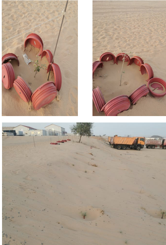
Figure 7. Terminalia mantaly planted by the CNPC in Niger