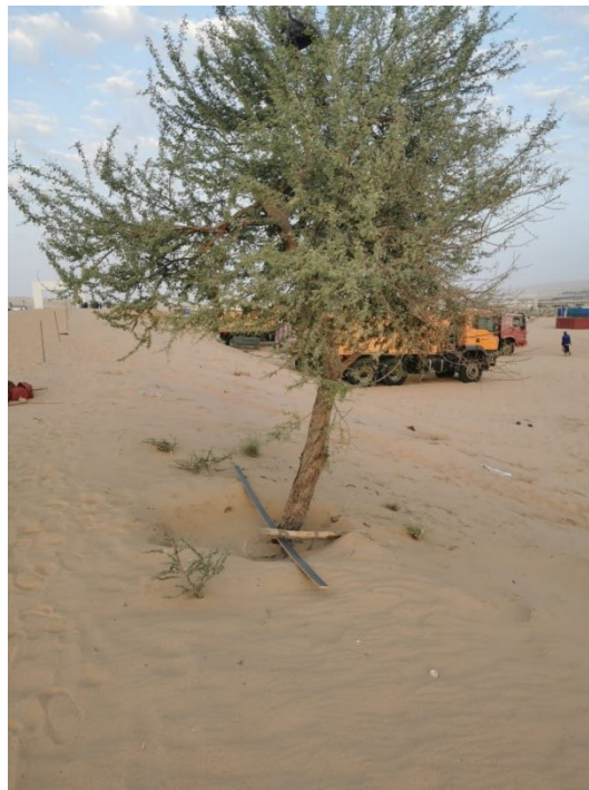
Figure 8. Protection of natural tree regeneration by the CNPC in Niger