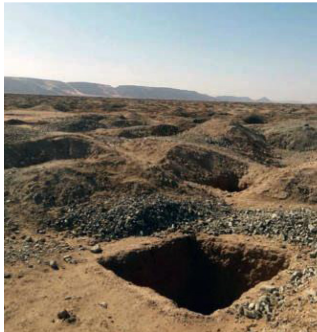
Figure 6. Land degradation emanating from the empty gold field in the Djado District of Northern Niger [34]

Figure 6 indicates degrading mining land in the Djado District in the Niger Republic by leaving empty potholes. Unfortunately, these are also traps for livestock and humans, especially hunters in the area.