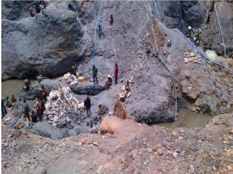
Figure 3. Artisanal mining at Amajim, Nigeria [10]

Mining impacts on the environment cannot be neglected due to heavy metals and machines affecting biodiversity (Figure 4). The land and vegetation that serves as the living organisms' abodes have been degraded in the Ameka. For example, water bodies have been polluted and rendered uninhabitable for amphibians. Moreover, using toxic chemicals such as mercury is dangerous to human survival due to the mobility of rivers and streams to adjoining ones.