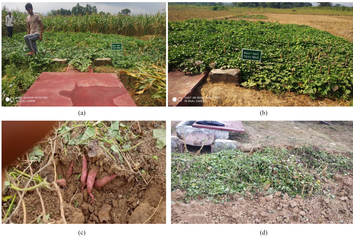
Figure 7. The harvesting view of maize and sweet potato crop under NWHR of India