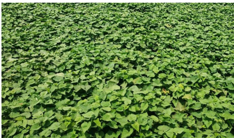
Figure 3. A sweet potato nursery at IISWC, Dehradun, India

Because of its high organic matter content, the soil in the northwestern Himalayan region is ideal for these crops. Both crops thrive well in a pH range of 6.5-7.5.