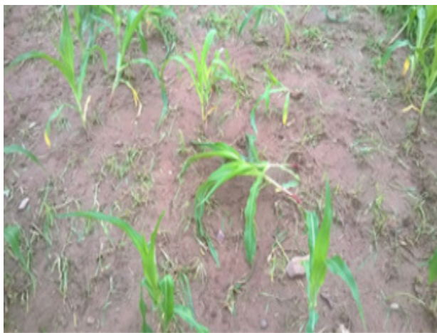
Figure 1. A sole maize crop of NWHHR damaged by high-intensity raindrops

Intercropping of rainfed maize + sweet potato can help commercialize agriculture in the North-Western Himalayan region while also reduce farmers' reliance on outside inputs including fertilizers, pesticides, and labour. In comparison to sole maize, which only covers 30% of the soil at this time, maize + sweet potato intercrop can cover up to 60% of the soil 30 days after planting. Sweet potatoes' dense foliage traps raindrops on their leaves, reducing their velocity thus protecting the bare soil. At a 2% soil slope, cultivating sweet potato with maize reduces soil loss to 1.5-2.0 t ha -1 , according to the present research. Sweet potato roots can reach a depth of one meter in the soil, boosting water absorption and minimizing runoff. Aside from the highest quality tubers, this crop produces 5-7 tonnes of dry biomass (including dry stem, leaves, and fine roots) from a hectare field. Its biomass contains 40.0-42.0% C, 1.5-2.02% N, 0.15-0.27% P, and 1.05-1.78% K. A hectare of biomass can recycle around 3.0-3.5 tonnes of C, 100-120 kg of N, 13.5-16.2 kg of P, and 89-106 kg of K [6]. In the soil, sweet potato biomass degrades quickly and becomes a good compost. Adding sweet potato leftovers to the soil will result in a large increase in carbon and soil nutrient content.