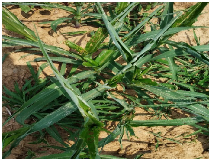
Figure 5. Fall armyworm attack in maize crop under maize + sweet potato intercropping in NWHR of India