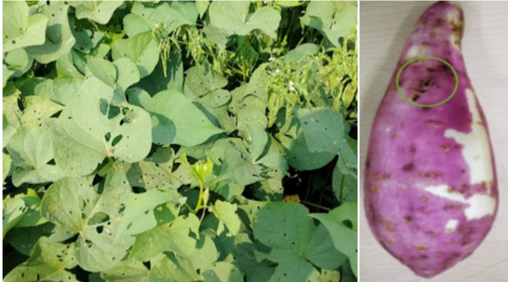
Figure 6. Leaf & tuber damage caused by sweet potato weevil

taken from a 2 \times 2 \text{ m}^2 area. The maize crop from maize + sweet potato intercropping can be harvested first during the last week of September (Figure 7). Maize plants can be left in the field for 3-4 days to allow for thorough drying before being shelled and threshed. Under rainfed conditions, a maize crop intercropped with a sweet potato can yield up to 3.0\text{-}3.5 \text{ t ha}^{-1} of grain and 4.0\text{-}4.6 \text{ t ha}^{-1} of straw.