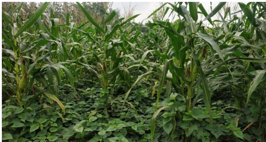
Figure 4. A weed-free maize + sweet potato intercrop system at IISWC, Dehradun, India

The high vegetative cover produced by the sweet potato crop discourages the growth of weed flora and maintains the field clean (Figure 4). Once the maize crop had grown to about 1 meter in height, it was no longer susceptible to weed damage. In the rainfed maize + sweet potato intercrops, only a few annuals & perennial weeds including Commelina benghalensis (Benghal dayflower), Cyperus rotundus (purple nutsedge), Cynodon dactylon (Bermuda grass), and Solanum nigrum (black nightshade) were seen. Weed management measures are only required during the first growing stages of both crops. A spray of pendimethalin 30 EC @ 1.0-1.5 kg ha -1 a.i. can be applied at the time of first ploughing and before sowing of crops for proper weed control. Aside from that, efficient weed management requires one hand weeding is required at 25-30 days after sowing/planting both crops.