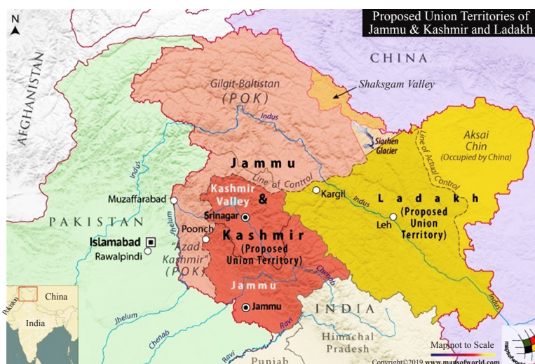
Figure 1. Map of UT of Jammu & Kashmir, India

Further, the inductive approach has been used. In the case of the inductive approach (Lathlean, 2006), no predetermined structure or framework is imposed on the data. Rather the findings or results are made to emerge from the data. Though the identification of major highlights is time-consuming, it is the most suitable and most commonly used approach. Many scholars impute the bias in subjective studies to a predecided framework, within which the respondents are made to fit their responses.