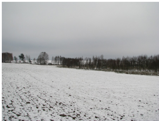
Figure 2. Wąpiersk bog, November 2018