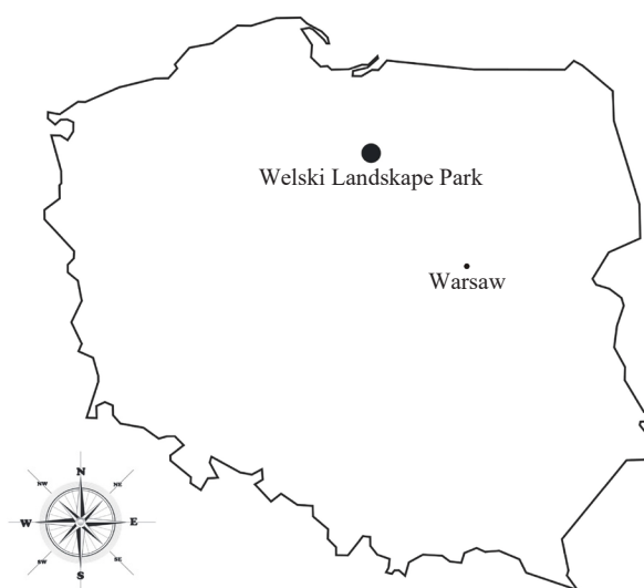
Figure 1. Localization of Welski Landscape Park

Northern Poland is of particular interest because it possesses several peat deposits, some of which are ombrotrophic, i.e., exclusively fed by atmospheric deposition. This region is also interesting as it is located at a relatively far distance (several hundreds of km) from the main Polish pollution centers-Śląskie Voivodeship (south of Poland). 25