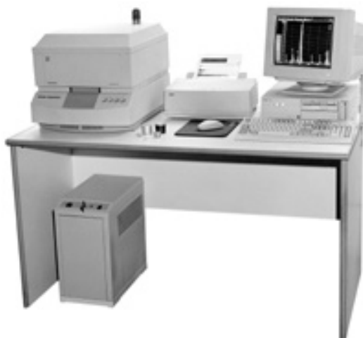
Figure 6. Spectron-Optel RMA WD-XRF spectrometer

The analysis was performed on the Spectron-Optel RMA WD-XRF spectrometer with 46Pd anode (Figure 6). The quantitative analysis of metals in the peat ash was carried out using certified standards. 27,28