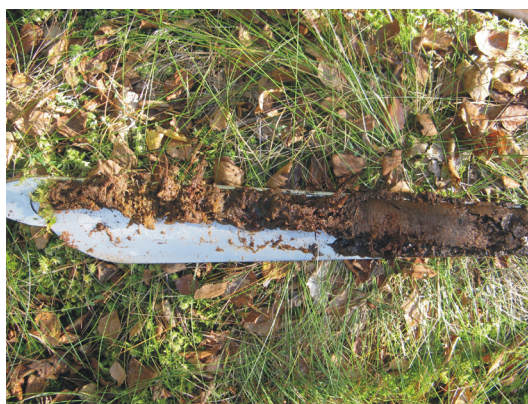
Figure 4. The cross-section of the peat core Las Nadwelski bog, March 2019

Peat was collected from depth of 0.5 meters with an auger INSTORF. Figure 4 shows the cross-section of the peat core Las Nadwelski bog (before vegetation time, March).