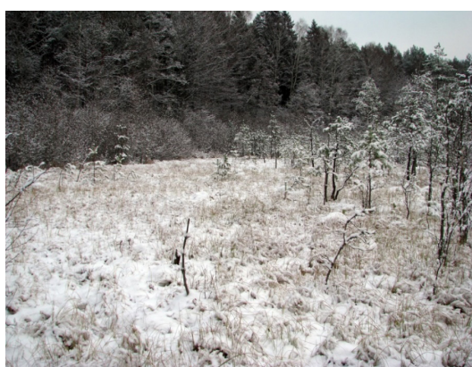
Figure 3. Las Nadwelski bog, November 2018

The research was carried out after vegetation time (November, Figure 2 and Figure 3) and just before vegetation (March).