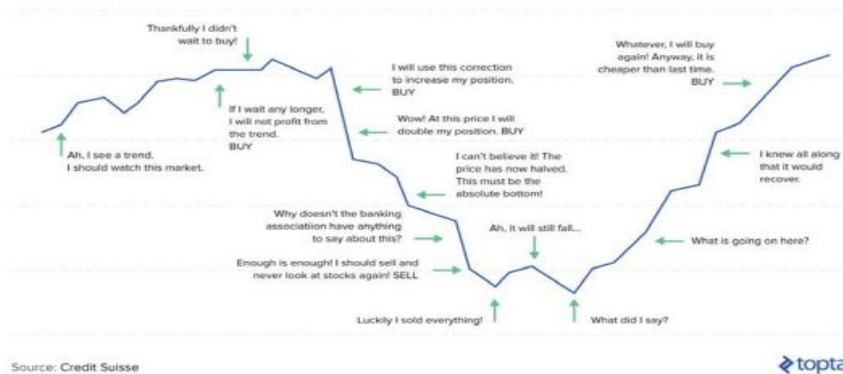
Figure 1. Investment Process - Roller Coaster of Emotion Suisse Group (2016)

Benjamin Graham is the investor's biggest problem and worst nemesis. As said. We all have biases, even if we say we don't. It influences conscious and unconscious decisions. Behavior bias. Behavioral biases are irrational attitudes or acts that can impair decision-making. Emotional and cognitive biases are examples. Ben Seager-Scott Emotional prejudice involves reacting to feelings instead of facts, which affects judgment. Cognitive bias is a processing or interpretation inaccuracy. Markets and humans aren't reasonable. Traditional economics assumes a reasonable man. Mankind doesn't always act sensibly, though. Behavioral economics acknowledges this. Investors often experience the "emotional roller coaster" below.